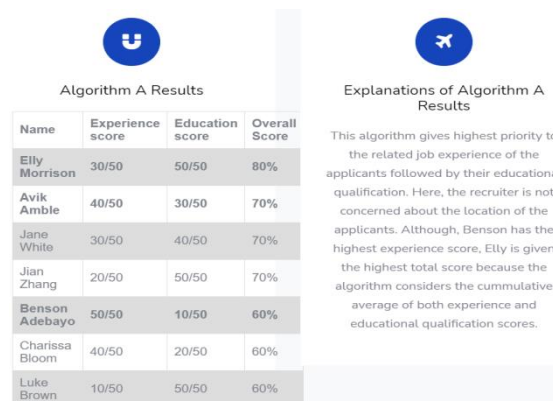
Figure 2. Results and Explanations of Results

We used a within-subject survey (pre-study/post-study questionnaire) to see if participants' perceptions of e-recruitment systems change after interacting with our explanation-enhanced prototype e-recruitment system.